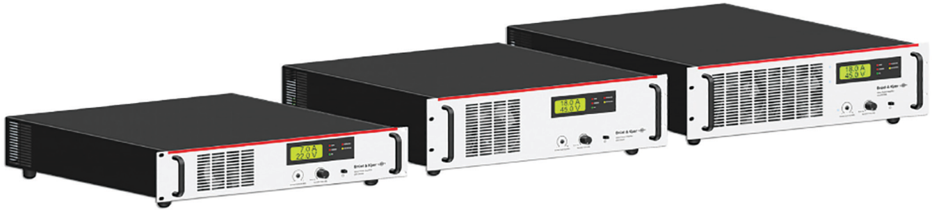
Fig. 2 Left to right: LPA100 Amplifier, LPA600 Amplifier and LPA1000 Amplifier