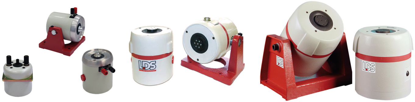
Fig. 1 Left to right: V100 Series shaker, V200 Series shakers (one trunnion mounted), V400 Series shakers (one trunnion mounted), and V450 Series shakers (one trunnion mounted)