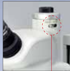
Optical path switching lever

The SMZ745T incorporates an optical path switching lever that enables easy switchover between eyepiece and camera. Nikon Digital Sight series camera can be attached.